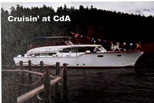
Cruisin' at CdA