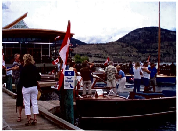
Pendicton Boat Show

A: Change the oil before it sits for the winter. Add a fuel stabilizer to the gas tank. Follow the instructions on the bottle for the right amount to mix with fuel.