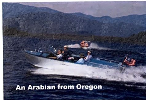
An Arabian from Oregon