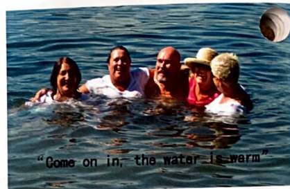
"Come on in, the water is warm"