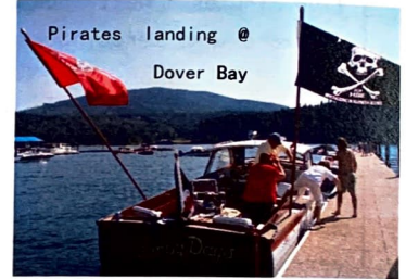
Pirates landing @ Dover Bay