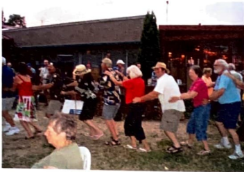
^ Conga line - Welcome Aboard Party