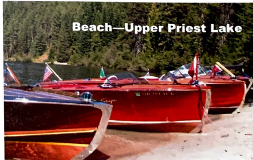
Beach—Upper Priest Lake