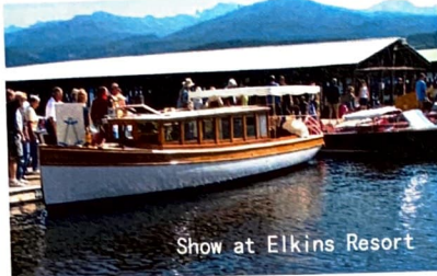
Show at Elkins Resort