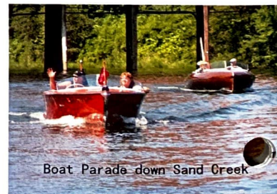
Boat Parade down Sand Creek