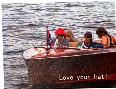
Love your hat!